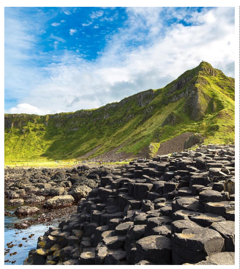
13 Days ● 18 Meals : 11 Breakfasts, 7 Dinners

HIGHLIGHTS... Edinburgh, Edinburgh Castle, St. Andrews, Loch Ness Cruise, Urquhart Castle, Highland Evening, Glasgow, Belfast, Titanic Experience, Giant's Causeway, The Causeway Coast Rail Journey, Derry, Cider Farm Tour, Dublin